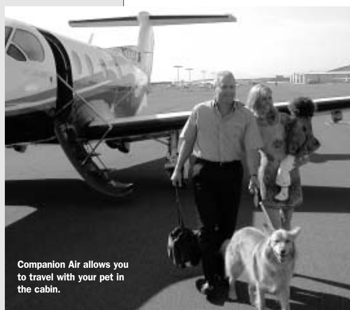
Companion Air allows you to travel with your pet in the cabin.

For example, for any air travel, whether as baggage or cargo, dogs must be at least eight weeks old and weaned before traveling by air. Kennels must be hard-sided, well-ventilated on three to four sides and have rims to prevent another kennel or luggage from blocking the ventilation, and have a leakproof, solid floor layered in an absorbent material for sanitation. The dog must be able to sit, lie down and turn around comfortably in the kennel. Handles must be accessible to airline personnel so that they can grip the kennel without putting their fingers within biting range. Likewise, food and water dishes must be attached securely and in a way that can be accessed without opening the kennel door. Instructions for feeding and watering the dog during a 24-hour period must be attached to the kennel. Furthermore, when you check your dog in, you must sign a document that you have fed and